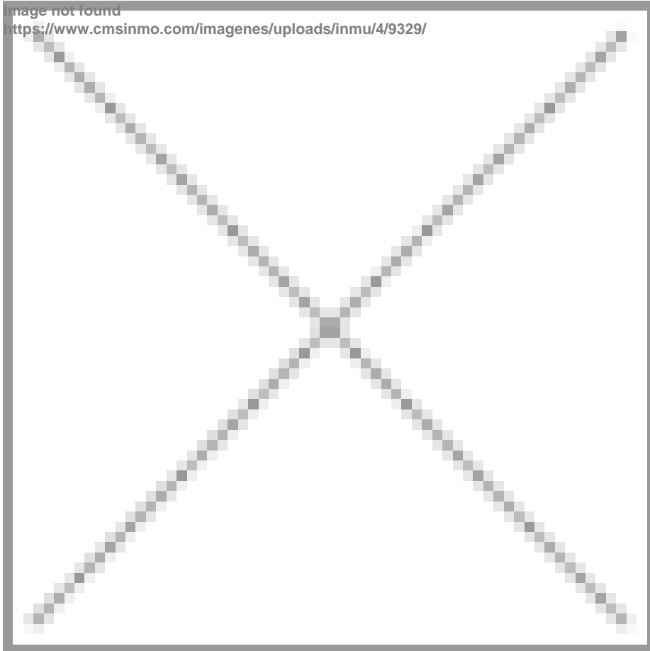
Image not found https://www.cmsinmo.com/imagenes/uploads/inmu/4/9329/