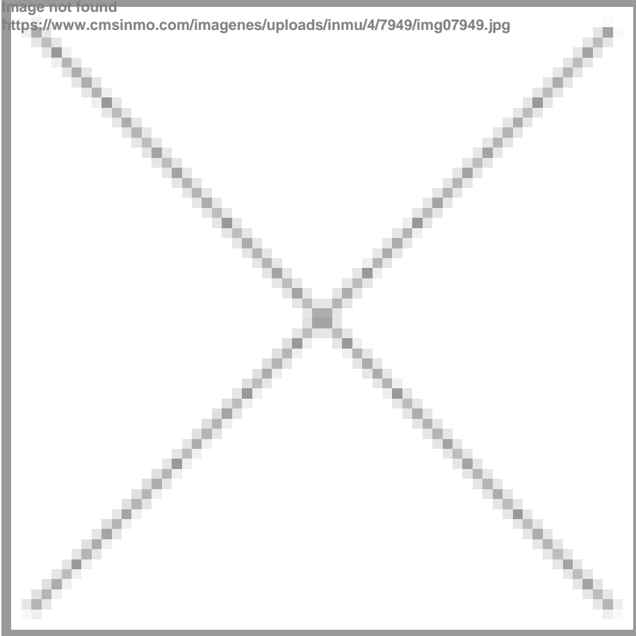
image not found https://www.cmsinmo.com/imagenes/uploads/inmu/4/7949/img07949.jpg