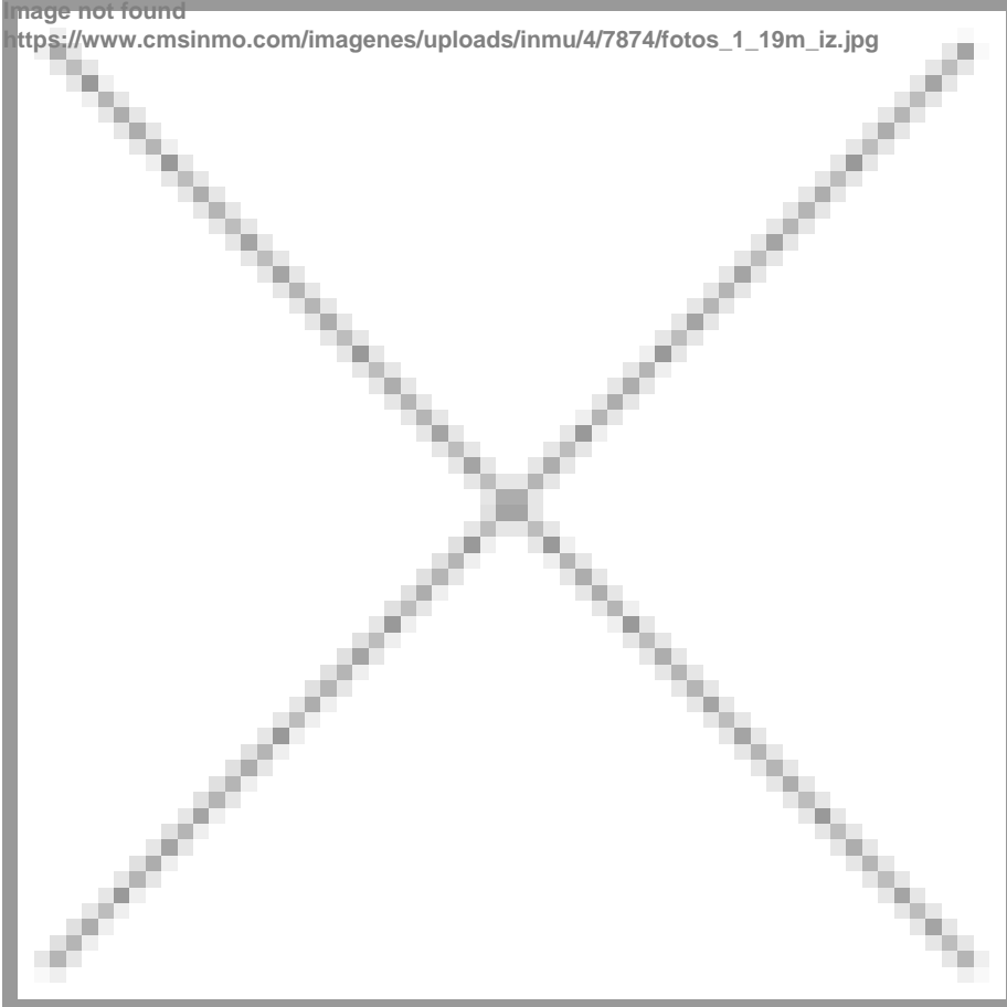
Image not found https://www.cmsinmo.com/imagenes/uploads/inmu/4/7874/fotos_1_19m_iz.jpg