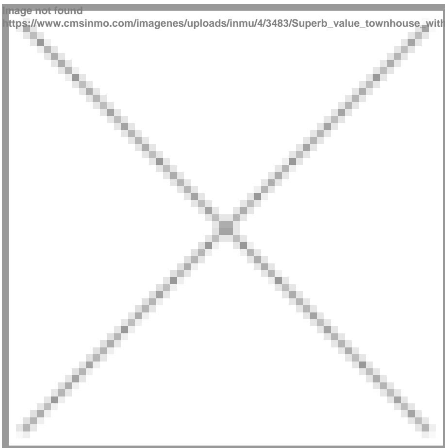
image not found https://www.cmsinmo.com/imagenes/uploads/inmu/4/3483/Superb_value_townhouse_with_great_v