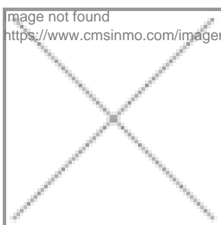
image not found https://www.cmsinmo.com/imagenes/uploads/inmu/4/3483/Superb_value_townhouse_with_great_v